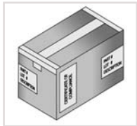
Sealed carton with corner labels and Certificate of Irradiation