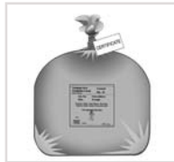
Carton liner holds primary bag(s)