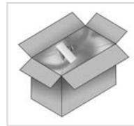
Open carton with taped down liner