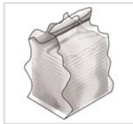
Primary Bag, heat sealed