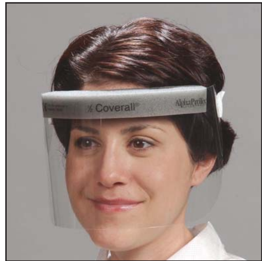
2808 Half Face Shield with Comfort Band