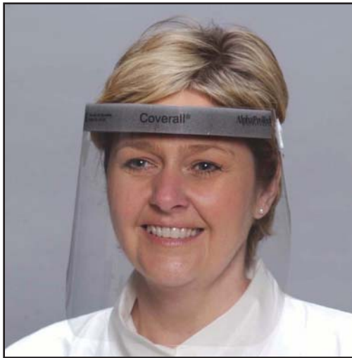
2807 Full Face Shield with Comfort Band